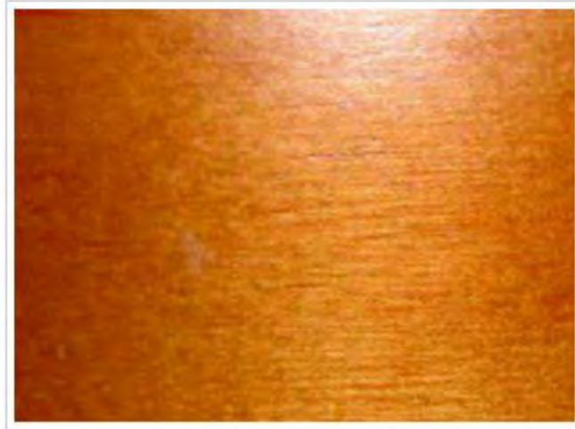
C2 ( cherry ) wood finish