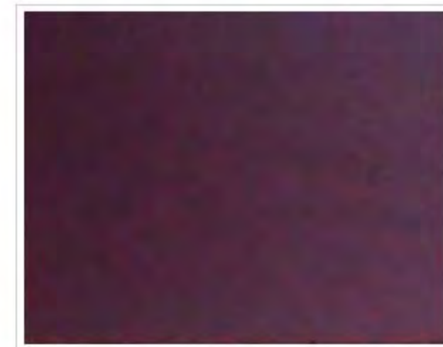
P7 (purple ) Wood Finish