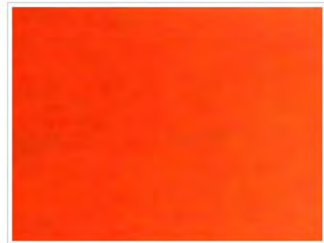
O6 ( orange ) wood finish