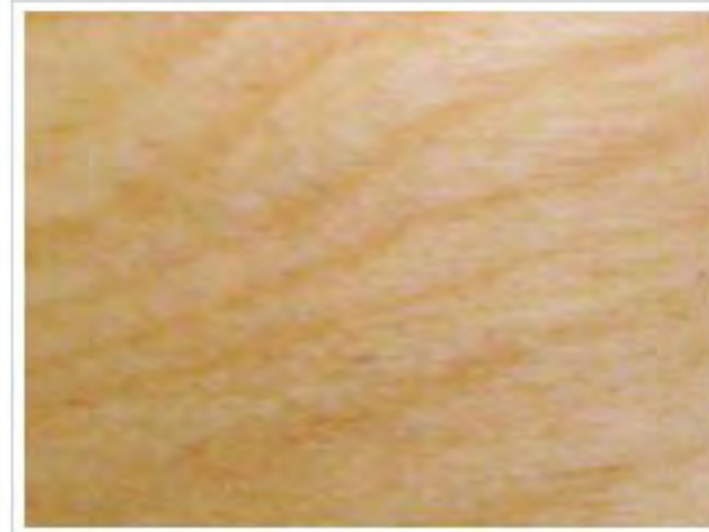
N3 ( natural ) wood finish