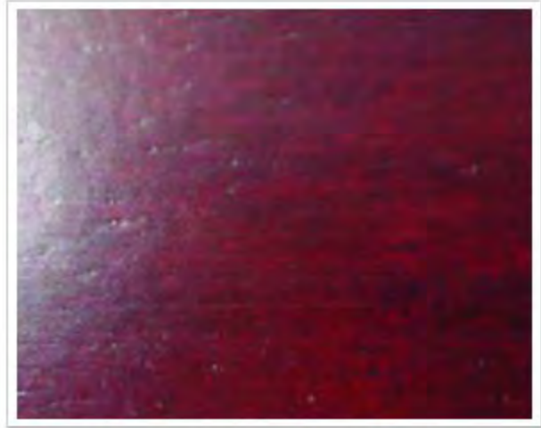
M1 ( mahogany ) wood finish