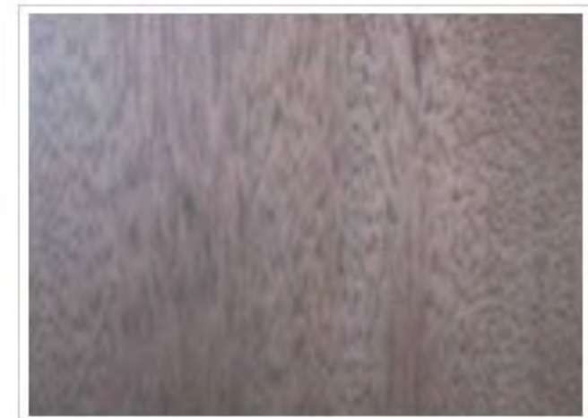
T8 ( teak ) wood finish