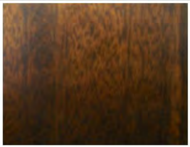
W5 ( walnut ) wood finish